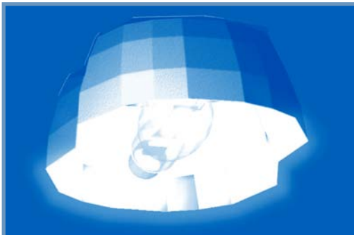
MAXIMUM CANDLE POWER DISTRIBUTION CURVE